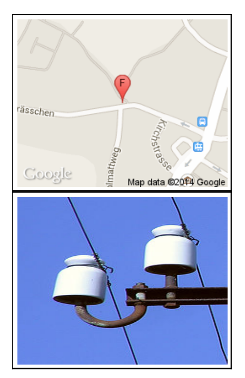
Electric house in Riehen - insulation devices