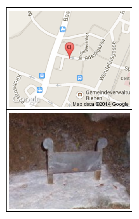
Rössligasse in Riehen