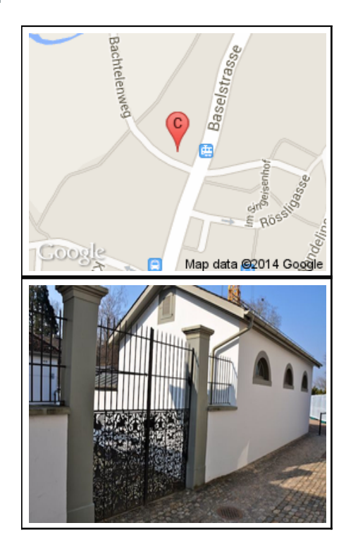
Gate of Fondation Beyeler

The original of this gate is kept in the Spielzeug- und Dorfmuseum Riehen ("Riehen Toy and Village Museum").