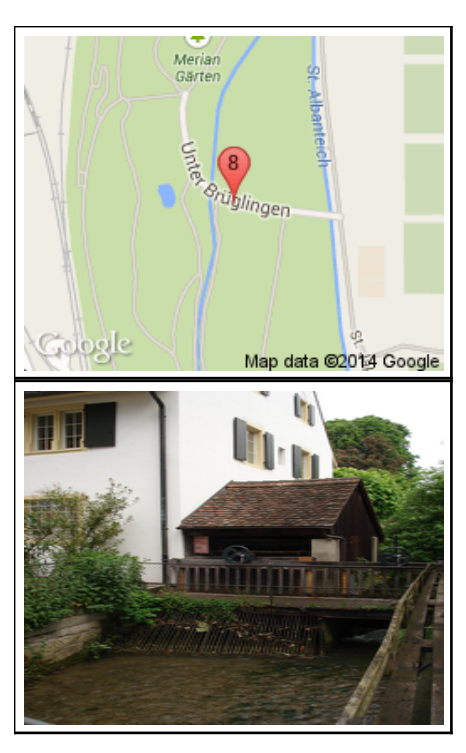
Brüglingen farm and mill

Go into the museum and have a look at the various mills. In the basement, at the back on the left, there is a sack of flour.